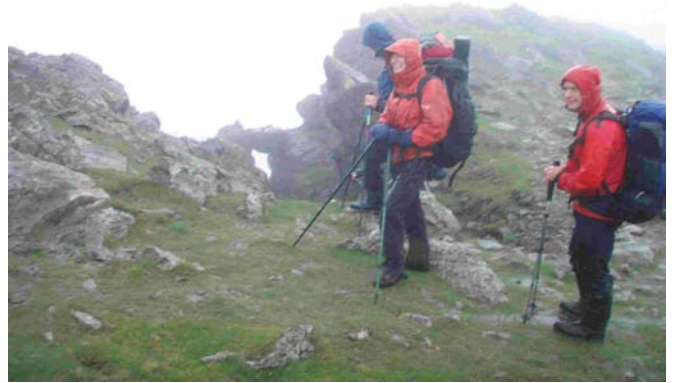
The Window at the head of one of Dow Crag's gullies.