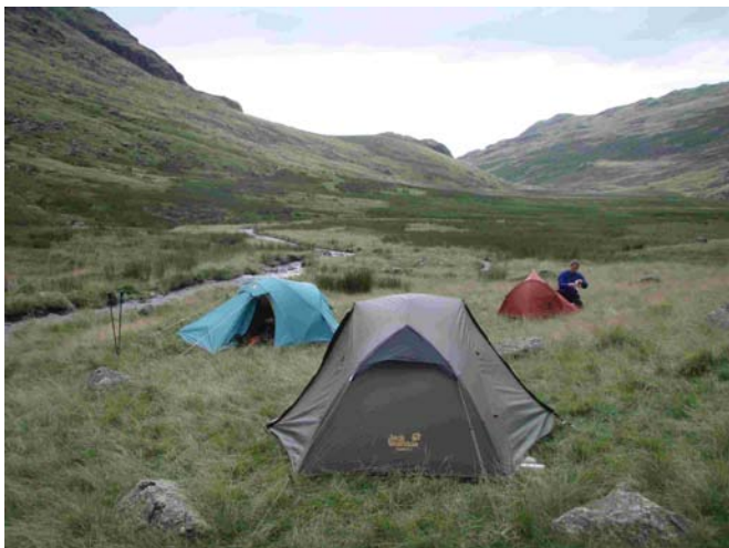
Looking down the valley towards Seathwaite Tarn

We adapted and extended the route as took our fancy and after a glance down at our intended wild camp site at Seathwaite Tarn where the water level was very low and there seemed to be some building work, we decided to camp further upstream. After a slightly knee jarring descent we followed Tarn Head Beck until we found a flattish spot with a view that met with Sylvia's approval. ☺