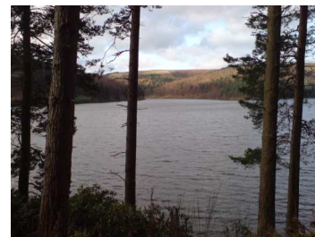
View across the water