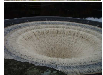
The whirlpool in Ladybower Reservoir