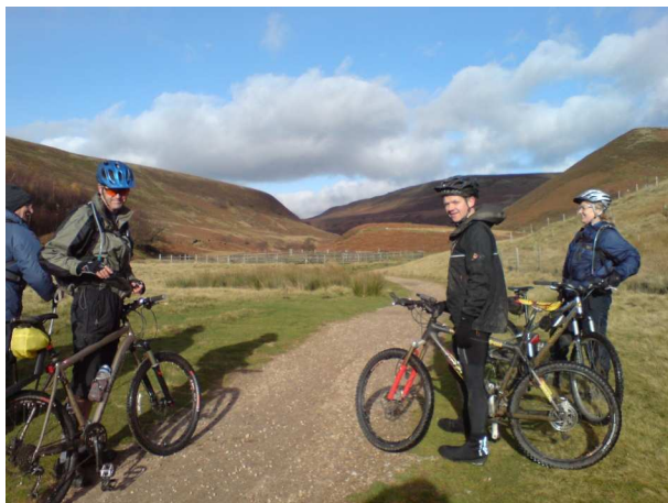
Part of the Sunday biking team enjoy the sunshine

The route on Sunday was a lovely way to "warm" down after the day before.