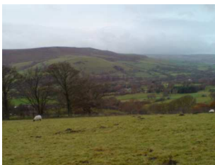
View behind hut